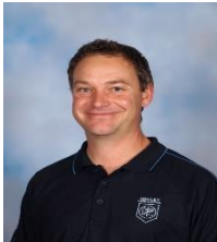
Mr Mike Tyson